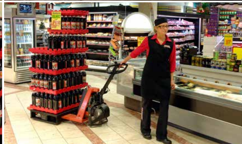
For nearly effortless movement of goods, the BT Pro Lifter (LHT100) has an electric motor built into the main wheel. This means that loads of up to one tonne can be moved at the touch of a button.