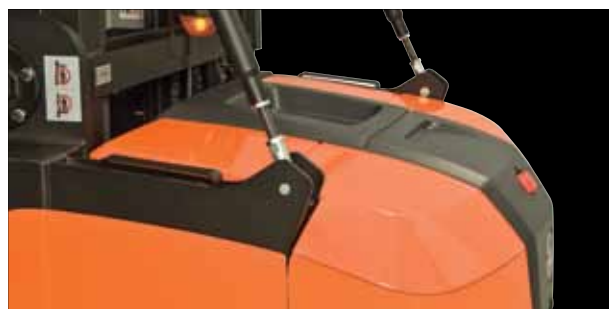
Non-exposed parts, such as the battery cover, are made of plastic to save weight