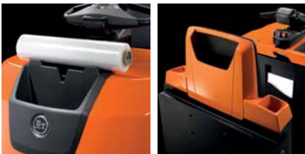
BT Optio L-series offers useful front and rear storage compartments. The front compartment even has a rest for shrinkwrap

The BT Powerdrive system means that as soon as the E-man control handle is released smooth progressive braking is applied, to ensure smooth, responsive control.