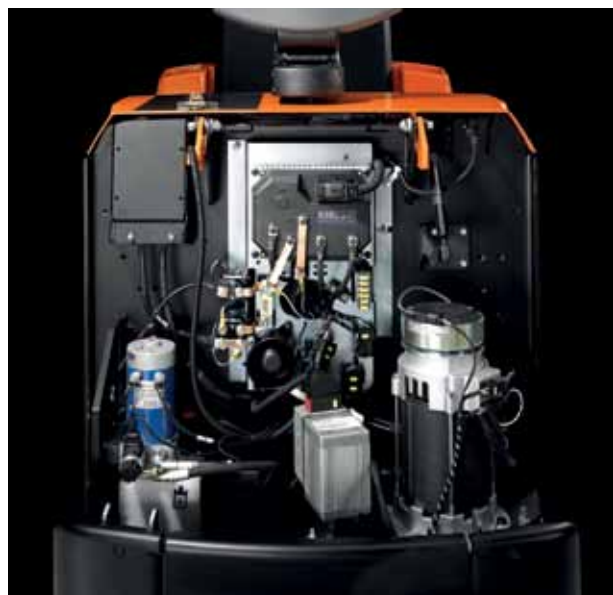
L-series models have excellent service access, helping to keep your operation running