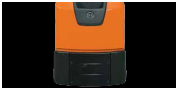
The OME100N's narrow chassis is robust and reliable – ideal for 'free ranging' operation