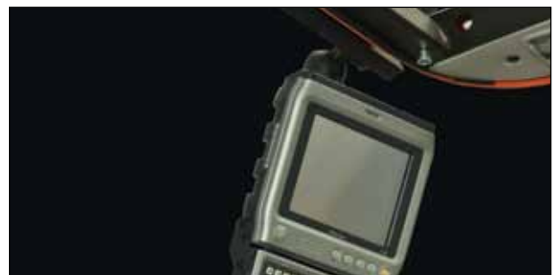
The unique E-bar can be specified in a number of locations for mounting and powering devices such as computers and barcode scanners