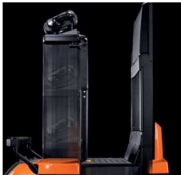
BT Optio L-series models with elevating platforms also have elevating controls, allowing manoeuvring and driving without having to lower the platform