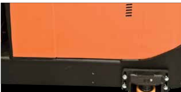
All exterior parts are made of steel, for strength and protection

Periodic maintenance is a requirement for all forklift trucks, but the BT Optio H-series is designed for long service intervals. For example, its AC motors are brushless and its gearbox oil will never need to be replaced. At the end of its life, BT Optio H-series is 99% recyclable.