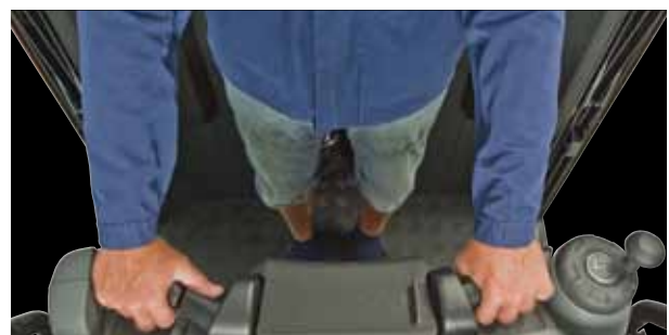
The multiple presence system ensures that the operator is safely in the cab before the truck can move