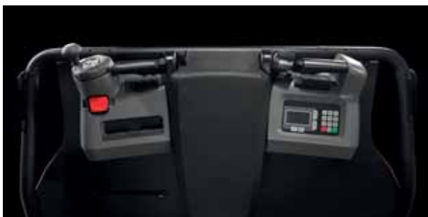
The cabin and controls are designed to make picking to a pallet as easy as possible

All controls are height adjustable and drive and lift/lower functions are fingertip controlled for maximum precision.