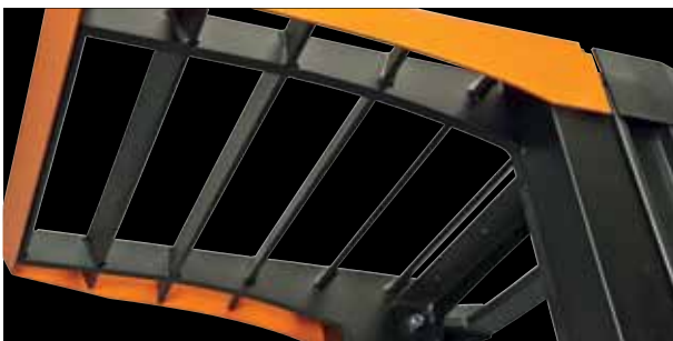
The overhead guards on M-series 'M' and 'N' models offer full protection for the operator without impeding his or her view

The BT Powerdrive system with advanced AC motors on 'N' models provides reliability and simplicity. CAN-Bus technology means fewer parts and reliable motor and system control. Routine and emergency maintenance is straightforward, with easy access to all components.