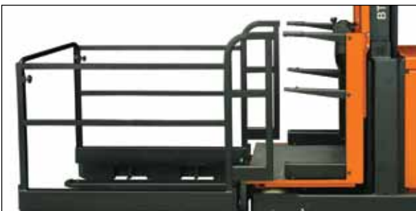
M-series 'W' models have a 'walk-through' design for picking bulky articles

Efficient administration is essential in order picking and the BT Optio OME100N and OME100NW provide a very effective mobile office, with several storage compartments to allow organised working. The truck is also prepared for a shrinkwrap holder and other accessories.