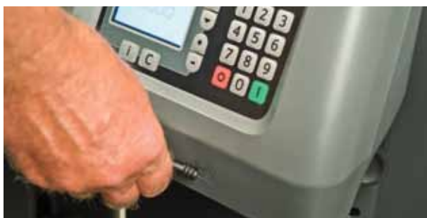
BT Optio H-series requires either a PIN-code or an ID key (option) to start

Efficient LED arrays provide in-cab lighting and there are several places to store items. A writing pad is integrated in the auxiliary lift cover. A cooling fan and radio/CD unit can also be specified.