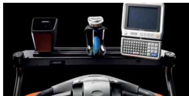
The BT Optio L-series E-bar option allows the mounting and powering of ancillary equipment such as computers and barcode scanners