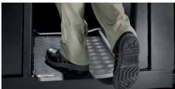
BT Optio's low step-in height reduces the strain of repeatedly stepping into and out of the truck. The floor is suspended to reduce vibration, helping some applications meet legislative requirements

The optimised truck performance system on the BT Optio L-series automatically adapts speed when cornering to allow fast yet safe driving in all conditions.