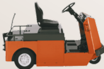
R-series – CBT4 / CBT6