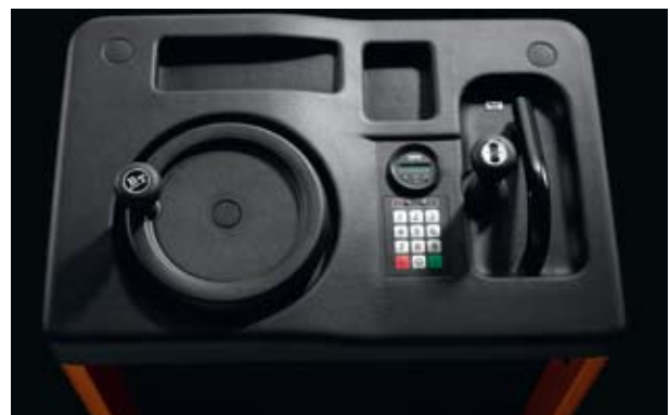
PIN-code access ensures that the trucks are only driven by qualified personnel

Service accessibility is excellent and the electronic fault finding function, along with the maintenance-free AC drive motor, ensures the N-series keeps working.