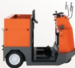
S-series – CBTY4