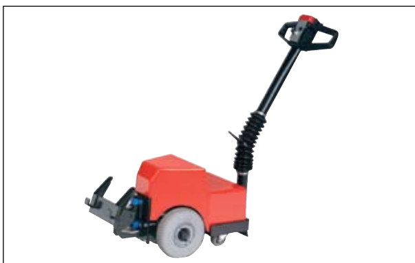
BT Movit W-series TWE100 – 1 tonne towing capacity With the TWE100, roll cages weighing up to 1000 kg can be transported with minimal effort, even on rough or uneven floors. By reducing the amount of manual effort involved in moving roll cages the TWE100 increases productivity and reduces the risk of strain or injury.

The N-series can tow multiple trolleys with a total load weight of up to 1000 kg (up to 500 kg if trolleys without brakes are used). For multi-shift work, the battery is easily accessed using a built-in cassette. A second battery cassette plus battery table make it easy to change batteries in only 20 seconds.