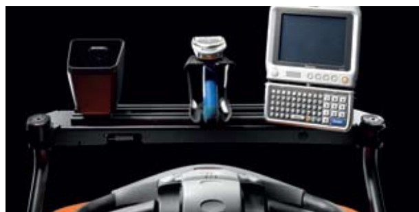
The BT Movit S-series E-bar option allows the mounting and powering of ancillary equipment such as computers and barcode scanners

One of the major wearing parts on most towing tractors is the drive-wheel, due to the stress of repeated starting and stopping. The smooth, controlled operation of the electronic braking system on BT Movit S-series trucks significantly reduces drive-wheel wear.