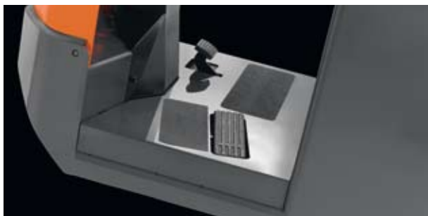
S-series' low step-in height makes getting on and off easy. The Operator Presence System (left-hand pedal) ensures that the tractor cannot be driven unless the operator is standing in the correct position

The Operator Presence System (OPS) only allows operation of the tractor if the operator is standing in driving position, enhancing safety.