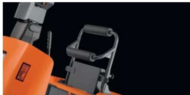
The backrest is height-adjustable to accommodate different operators in comfort

Easy servicing keeps downtime and cost to a minimum.