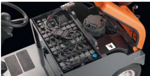
Toyota Tracto R-series electric models feature a 48 V electrical system with AC motors, for responsive, energy efficient power delivery and simple maintenance

Toyota durability is built-in to every part of these models, including the Toyota-designed and built engines and transmissions. These achieve low exhaust emissions compliant with latest diesel emissions regulations.