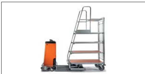
A BT Movit N-series truck docked with a step carrier

Toyota Material Handling Europe is also able to work with customers to design and build bespoke load carriers to suit the precise requirements of their applications.