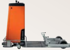
N-series – TSE100 / TSE100W