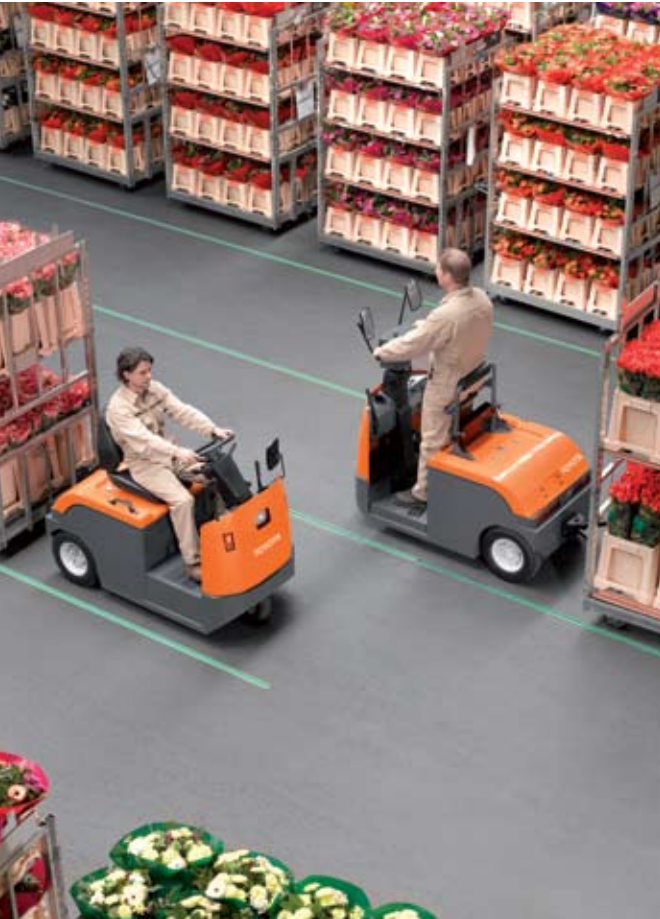
4CBT2 (left), 4CBTY2 (right)