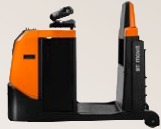
S-series – TSE300