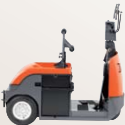
S-series – 4CBTY2 / 4CBTYk4