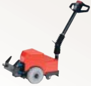
W-series – TWE100