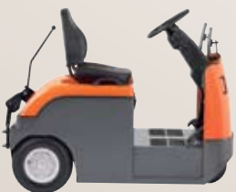
R-series – 4CBT2 / 4CBT3 / 4CBTk4