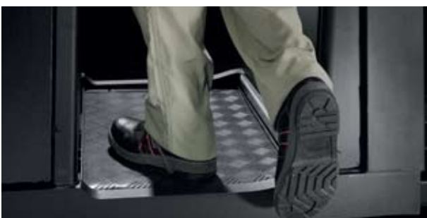
The TSE300's low step-in height reduces the strain of repeatedly stepping into and out of the truck. The floor is suspended to reduce vibration, enhancing driver comfort

The E-man control system on BT Movit S-series models is based on an extremely flexible steering arm with touch-sensitive activation of the drive function and effortless electronic steering. The steering arm is designed to follow the operator's position. It can be moved left and right to allow pedestrian control, walking alongside.