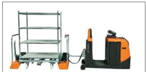
A BT Movit TSE300 towing host carrier, loaded with a separate shelf carrier