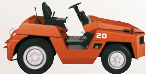
R-series – 2TG20 / 2TG25 / 2TD20 / 2TD25