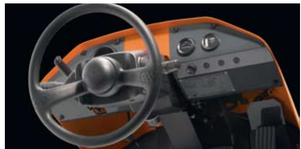
R-series models' car-like control configurations, with levers positioned at the operator's fingertips, make them easy to operate for long periods